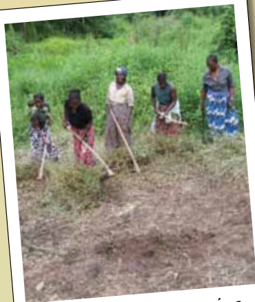
Working hard preparing the ground

Recently the area has suffered very heavy rain fall. The project started with 53 seed beds but lost 10 due to flooding. They lost garlic, ginger and some vegetables although Jomoh said 'not much'.