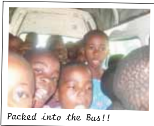
Packed into the Bus!!