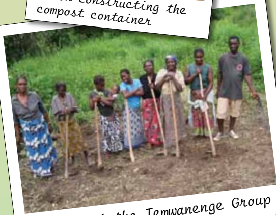
Members of the Temwanenge Group