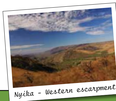
Nyika - Western escarpment

Want to know more: visit www.nyika-vwaza-trust.org