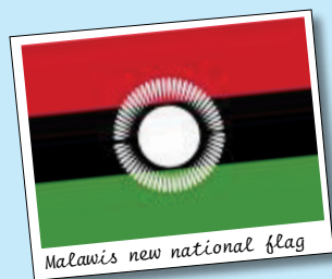
Malawi's new national flag

Malawi recently made a controversial change to its national flag which it had used since independence from Britain in 1964. A full sun now replaces a half-rising sun. President Mutharika told a rally in Lilongwe that national flags depict developments in a nation.