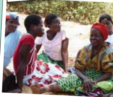
Time to relax