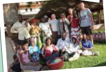
Friends all together