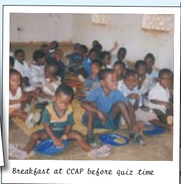
Breakfast at CCAP before quiz time