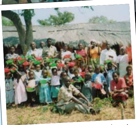
Salawe nursery inside and out