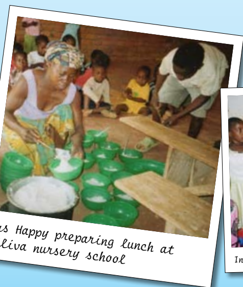
Happy preparing lunch at Siliva nursery school