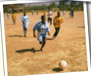
Great effort was expended

through to the finals of the FAM cup but we wish them good luck for next season.