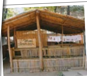
The aup Shelter